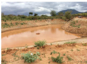
Water levels June 22, 2016