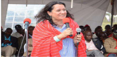
World Bank Rep Speaking during the Handover