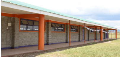
Completed Classrooms at Oloirowua