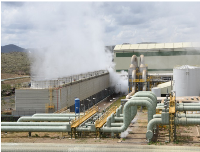
Olkaria IAU - 140 MW