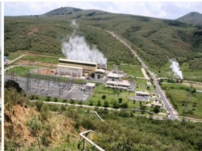
Olkaria II - 35 MW Geothermal Expansion