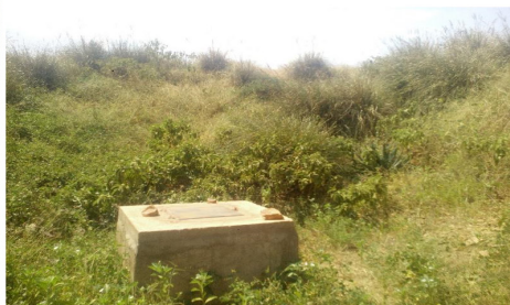
Embarkment January 4, 2018