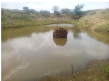
Water levels January 4, 2018