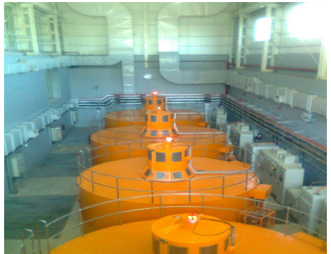
Tana Power Station