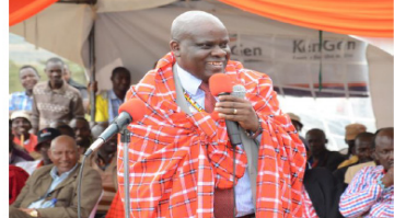
KenGen Chairman speaking during Handover