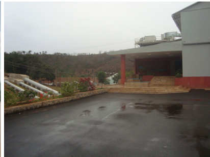
Tana - 20MW