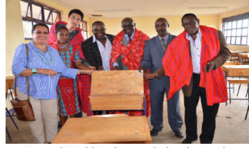
KenGen and World Bank Team during the Handover