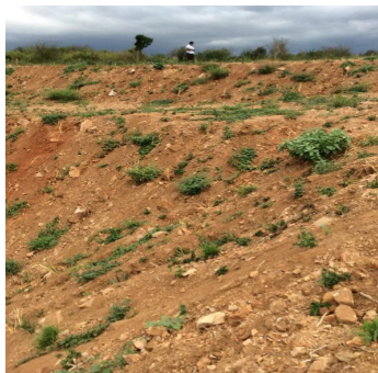
Embarkment June 22, 2016