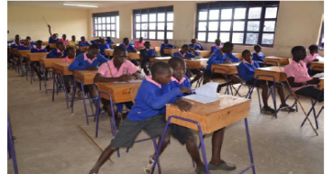
Children in Class at Oloirowua